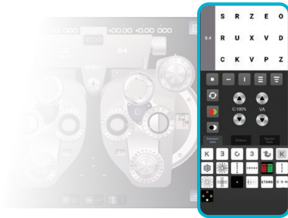
Chart Control VX25 or VX22 family