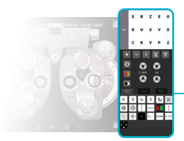
Chart Control VX25 or VX22 family